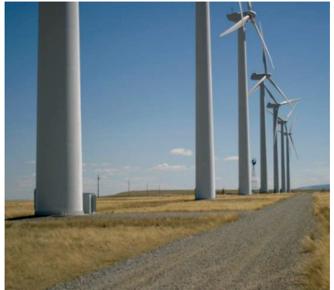
Fig. 3.1.1a—Typical row of turbines in a wind farm and their access road, Arlington, WY.

3.1.1 Wind farm development —A wind farm consists of several wind turbines distributed over a large area (Fig. 3.1.1a). Because the visual impact and land requirements are significant, the development of a wind farm is complex and often requires considerable public input. Figure 3.1.1b presents