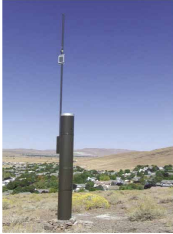
Figure 1-1. Example of an automated rain gauge.

Common rainfall interpolation techniques include Thiessen polygons (Viessman et al. 1972), inverse distance squared weighting (Chow et al. 1988), and kriging (Bras and Rodríguez-Iturbe 1985). Each interpolated method is some form of weighted averaging of individual rain-gauge observations to create an area averaged rainfall estimate.