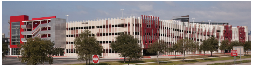
Fig. 1—University of Houston East Garage

Available background information and plans were reviewed, and a follow-up visual assessment of the damage was conducted on May 2, 2018. Prior to the second visual evaluation, the structural members within the fire-damaged area were cleaned using dry ice blasting that allowed a closer look at the extent of the damage.