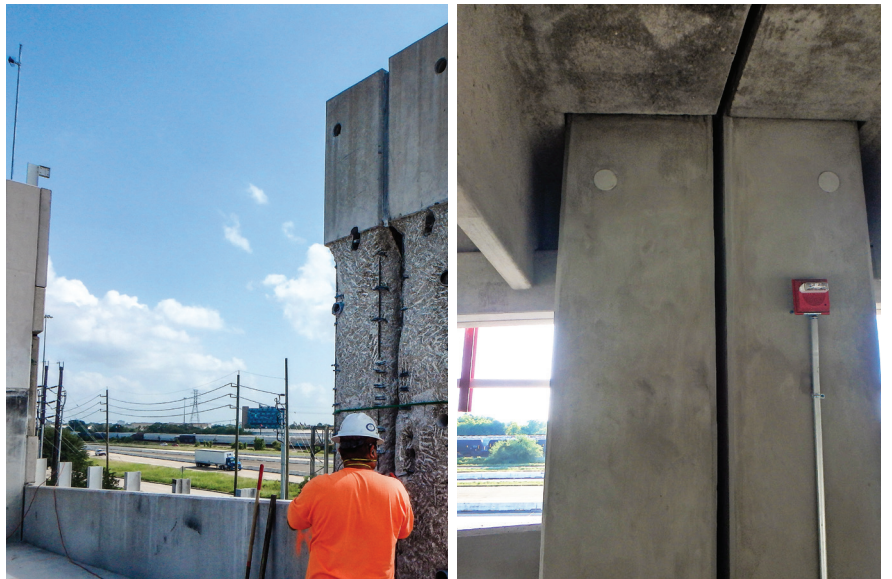
Fig. 9—Column during repair (left) and after repair (right)