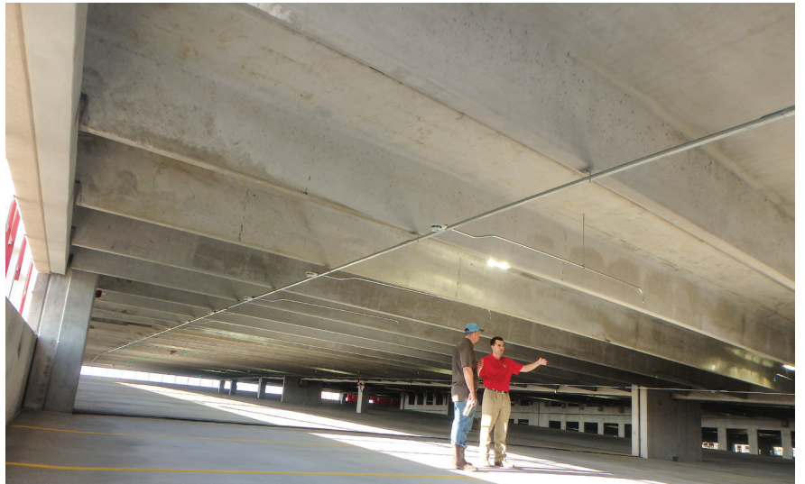
Fig. 8—New replacement double-tee beams at completion

The public garage proved to be a limited-space jobsite, leaving little room for repair materials and contractor use/laydown. While complexities were abundant, the project team worked efficiently to have the garage fully operational by the start of the fall semester. Ultimately, the team was able to come in under budget and ahead of schedule on repairs.