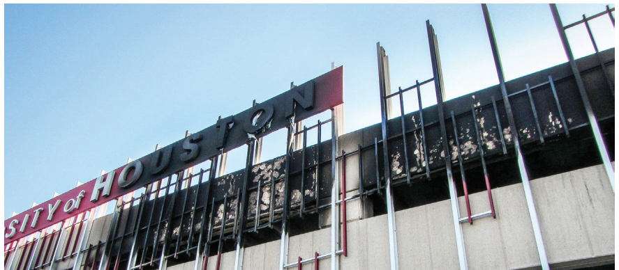
Fig. 3—Fire damage at exterior of garage