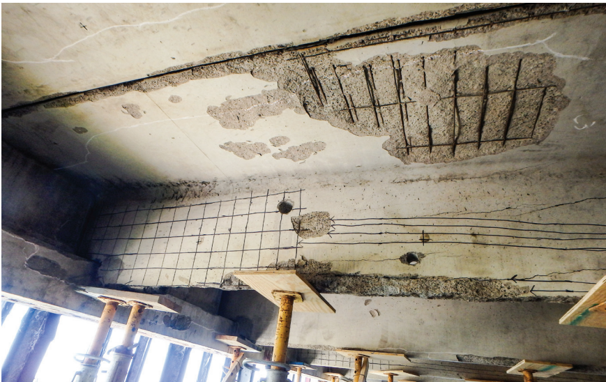
Fig. 6—Concrete cracking and spalling due to fire