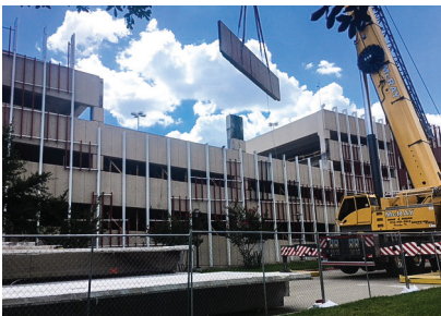
Fig. 7—Spandrel beam replacement

In addition to visual observations, a limited floor delamination survey was performed utilizing a chain dragging device to detect unsound concrete. An acoustical monitoring wheel and hammer sounding was used to detect delaminated concrete on the vertical and overhead elements.