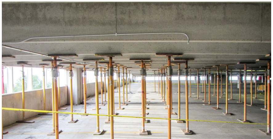
Fig. 4—Shoring installed in affected areas