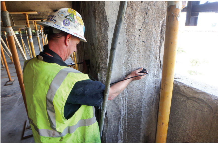
Fig. 5—Nondestructive testing performed at damaged column