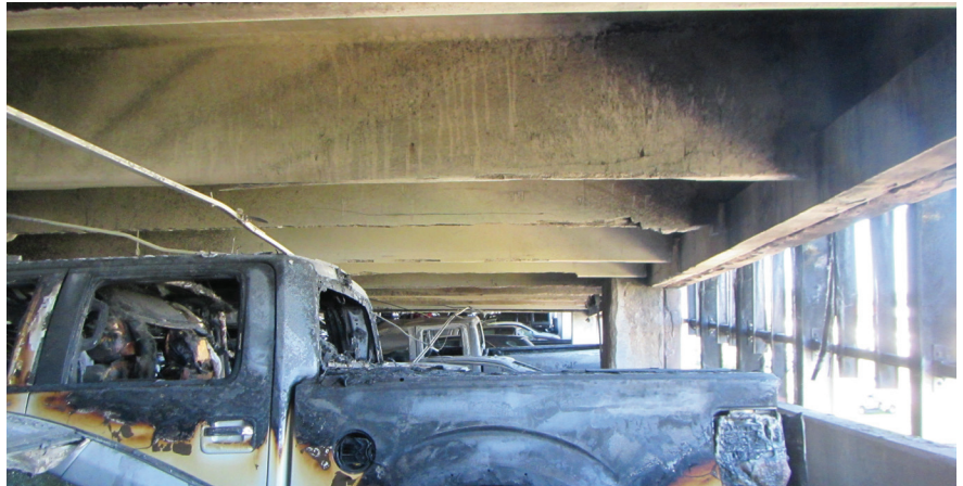
Fig. 2—Fire damage on Level 3 of parking garage