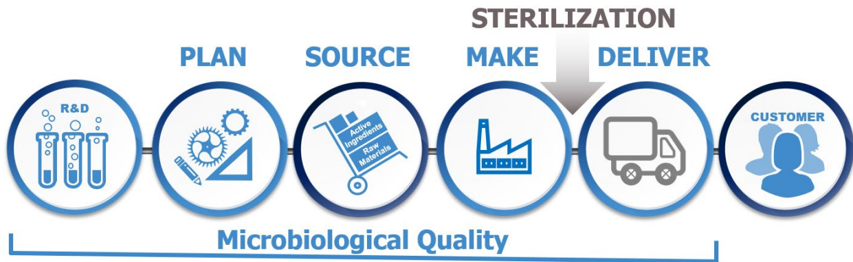
Figure 1—End-to-end process

The Supply Chain for a health care product is an end-to-end process that begins and ends with the customer. The health care product requirements are established based on the specific customer needs, and, in the end, the customer is the ultimate user of the health care product. The end-to-end process is defined as the following: Research and Development (R&D), Plan, Source, Make, Deliver, & Customer (See Figure 1). Addressing MQ&SA throughout the end-to-end process is critical to ensure that the finished health care product meets its defined requirements.